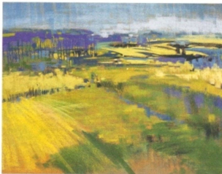
From a Hill (pastel, 18x24) by Jennifer Gardner of North Venice, Florida.

On a short flight from France to England, Jennifer Gardner watched as a brilliant patchwork of fields and hills unfolded before her and inspired this lyrical, impressionistic landscape. The artist employed intense and brightly colored soft pastels applied to sanded, tinted paper, in a color which blends rather than contrasts with her palette "to create a harmonious color scheme, to provide a unifying element, and to create an intriguing contrasting textural aspect." Her palette included both realistic and imaginary colors—the intense yellows and greens of the actual landscape enhanced by electric blues for impact. Her paintings, both impressionist and more abstract pieces, "are always born from an immediate reaction to a color element and an interesting pattern in a landscape." Gardner's painterly approach is both an expressive and passionate response to a subject that not only captivated her but also captivates the viewer.